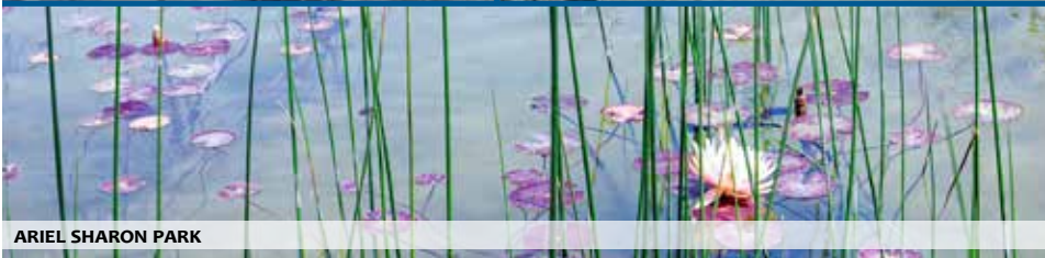
ARIEL SHARON PARK

SUNDAY, MAY 12 - Depart Newark with El Al nonstop flight #26 to Tel Aviv, leaving at 9:00pm.