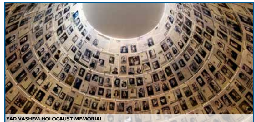
YAD VASHEM HOLOCAUST MEMORIAL

You will be transferred to the Ben Gurion Airport for your departure on El Al nonstop flight #25, leaving at 1:50pm and arriving at 6:35pm.