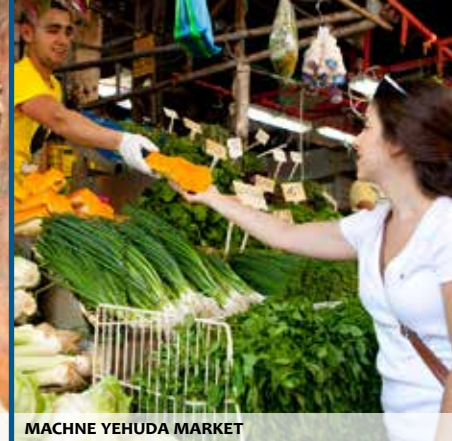
MACHNE YEHUDA MARKET