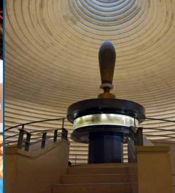
DEAD SEA SCROLLS EXHIBITION AT SHRINE OF THE BOOK