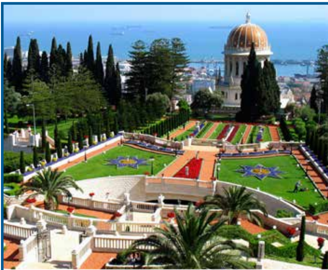
BAHA'I SHRINE, HAIFA

Drive along the Mediterranean Coast to the ancient port city of Caesarea, built by Herod the Great to honor Roman Caesar Augustus. Herod built a port in the bay and erected all the cultural institutions found in every great Greco-Roman city, including a theater, a hippodrome, a luxurious bathhouse and an extensive aqueduct system stretching from the springs of Mt. Carmel to Caesarea. Continue to Mt. Carmel and the city of Haifa. Enjoy the panoramic views of the largest port of Israel, and the Shrine of the Baha'i. Drive to Akko (ancient Acre), the maritime capital of the Crusader Kingdom. Visit the Knights' Halls, one of the most beautiful and impressive remains from this period. Visit Rosh Hanikra, one of Israel's most unusual natural phenomena. Drive to Tiberias for dinner and overnight. Stay in a Panoramic View Room at LEONARDO TIBERIAS on the Sea of Galilee. www.leonardo-hotels.com/israel-hotels/tiberias-hotels/leonardo-hotel-tiberias