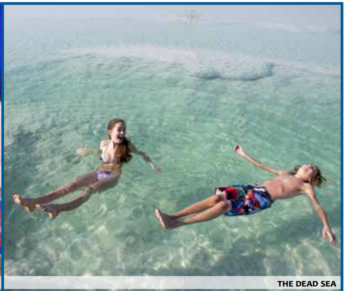
THE DEAD SEA