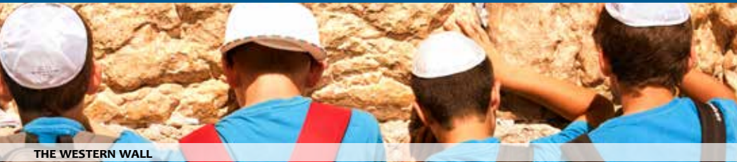
THE WESTERN WALL